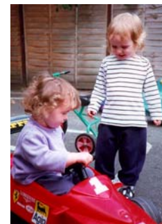
let's get to the bottom of this!

Everything we do in the nursery is a learning opportunity for our children and we continue to monitor their development. It is important for the young child to maintain a reasonably structured day, but with the better weather, even more time will be spent outside in our garden, picnics or outings such as to the park, the farm, art gallery or museums. There is such a lot to do.