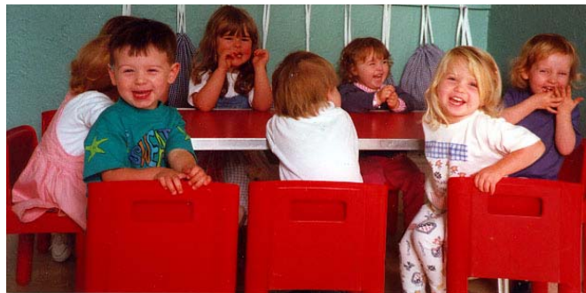
Afternoon tea has arrived, perhaps?

The afternoon day care session is similar in format to the morning but usually with different activities for the children to engage with and includes afternoon tea.