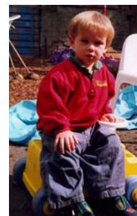
I'll just let the girls sort this out!