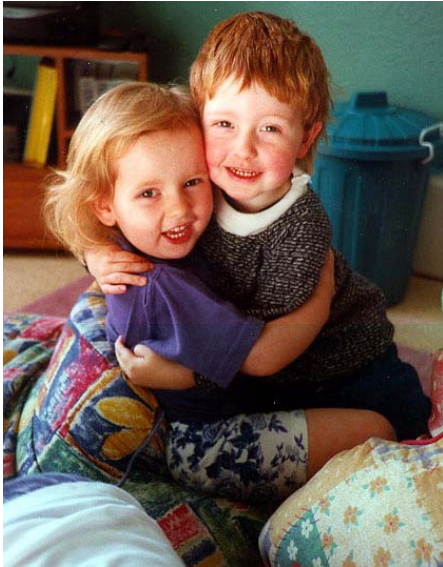
There is always time for a cuddle!

Each child is assessed on entry to the nursery, their development continuously charted and regular Parents' Evenings held. The children will learn simple computer keyboard skills and the latest educational computing programs are available. Visiting teachers of music and drama, dance and language are organised if there is sufficient demand.