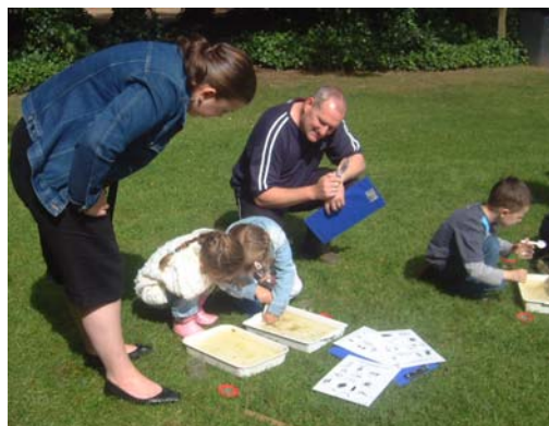
It's amazing what you find in a pond!

In good weather we apply lots of sunscreen, take a picnic, snacks, lots of drinking water, some games equipment and make the following visits - Chatelherault Park; Falls of Clyde, New Lanark; Strathaven Park; Craignethan Castle, Crossford; Lanark Loch; Tinto Hill; Calderglen; Clyde Action fun in the Park at Drumpellier park; Pond dipping, booked rain or shine at Chatelherault park; Strathclyde park; Motherwell Heritage Centre, fun day; Biggar Park; Water fun day, - bring water pistols and a change of clothes; Glasgow green,