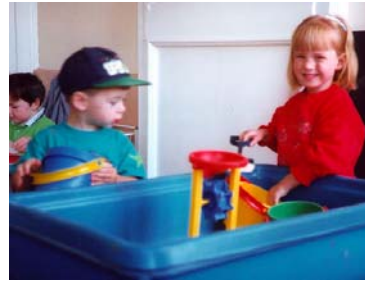
Let's do some research!

The Adventurers - Children from 2 - 3 years have their own activity and quiet areas. At this stage some Montessori educational materials and other equipment are introduced to provide an enjoyable and adventurous programme. The assessments at this stage concentrate on emotional development along with skills in identifying basic shapes, colour recognition, counting and language development. Outdoor play, visits and visitors will encourage the Adventurers to explore the outside world.