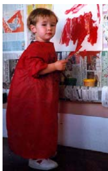
Just preparing my collection!

Children are mimics and learn fastest from one another. A very positive effect of nursery child care is to improve the social interaction of one child with the other. Equally it is important for their development that they have time with their own age group to develop their own skills. To that end, for their special sessions, the children are split into age bands of 6 weeks - 12 months, 1-2 years, 2-3 years, 3-4 years and 4-5 years and have been allocated group names consistent with their most persistent characteristics. All development progress is observed, assessed and recorded.