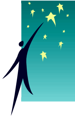
Hopscotch out of School Clubs