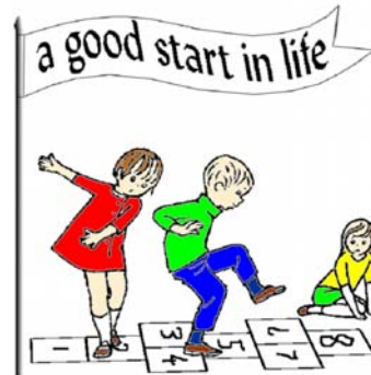
Hopscotch Day Care & Kindergarten